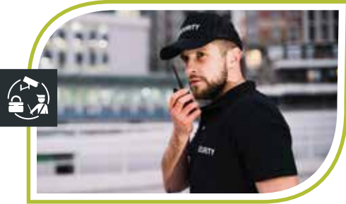
SAFETY & SECURITY