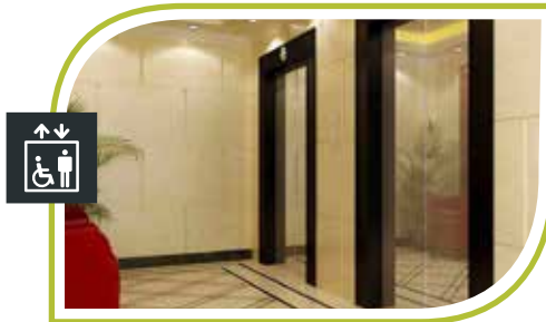
PASSENGER & FREIGHT LIFT