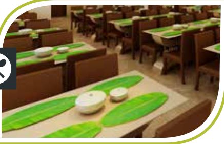
FOOD & DINING