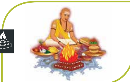
PUROHITS ON CALL