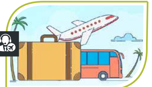
TRAVEL & TRANSPORT ASSISTANCE