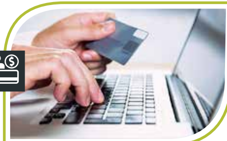
TIE UP WITH BANKS