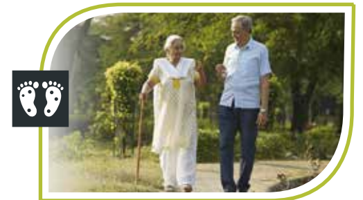
REFLEXOLOGY WALK WAY