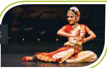
EVENTS & ENTERTAINMENT