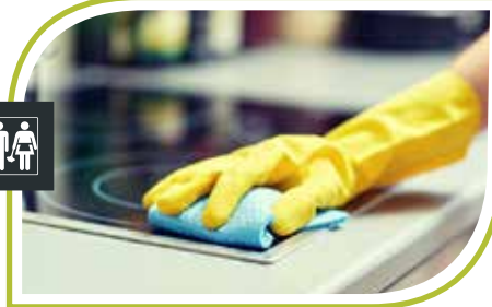
HOUSEKEEPING & MAINTENANCE